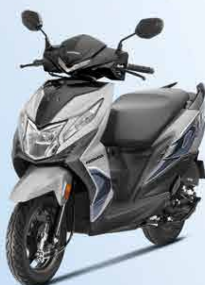
PEARL IGNEOUS BLACK + PEARL DEEP GROUND GRAY